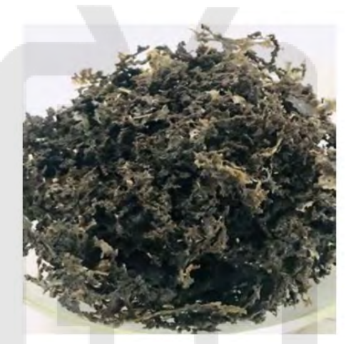
Figure 1 The isolated mucilage from Basella alba L.

The FTIR spectrum of the isolated mucilage indicated the presence of stretching vibration of hydroxyl groups (O-H) at 3,369 cm<sup>-1</sup> (broad), stretching vibration of alkyl group (C-H) at 2,928 cm<sup>-1</sup>, stretching vibration of carboxyl and carbonyl (COO<sup>-</sup>) at 1,638 cm<sup>-1</sup>, bending vibration of alkyl group (C-H) at 1,369 cm<sup>-1</sup>, and polysaccharide group (C-O-C) at 1,015 cm<sup>-1</sup>. The band corresponding to carboxylate group indicated the presence of uronic acid which is commonly found in mucilage (Quintero-García, 2021, p.1-18). As well as the wavenumbers between 800-1200 cm<sup>-1</sup> characterizes the fingerprint region for carbohydrate (Singh, 2014, p.713-725).